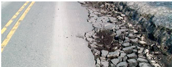
Posting and bonding by agreement can ensure that haulers pay for any damages they cause to the roadways.