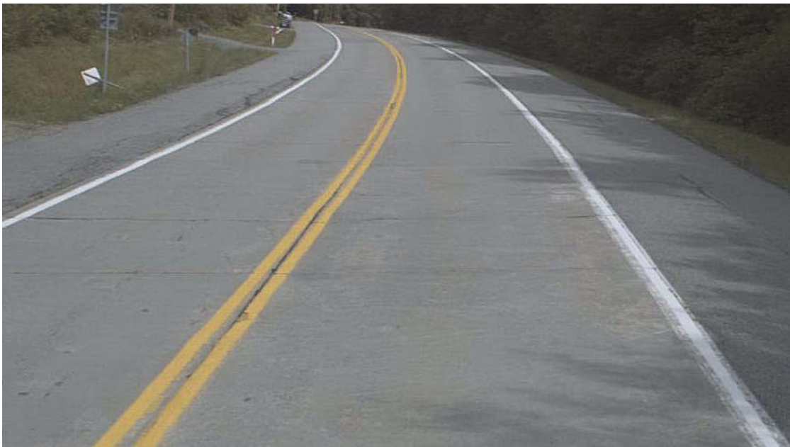
Figure 4. Example of Pavement Score = 7 in New York State (NYSDOT, 2010).

Personal communication with North Carolina DOT indicated that, when re-installing rumble strips on thin pavement overlays, the existing rumble strip pattern is milled and inlayed, and the milled pattern is then re-installed after the thin overlay is completed.