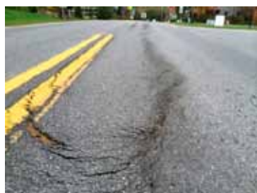
An insufficient tack coat application can lead to pavement failure.

Applying a bituminous tack coat is an integral part of an asphalt paving project. Research by the asphalt industry and PennDOT on the use of tack coat has resulted in some recent changes to PennDOT's construction specifications. Whether you do your road paving in-house or contract it out, your municipality must be aware of these changes.