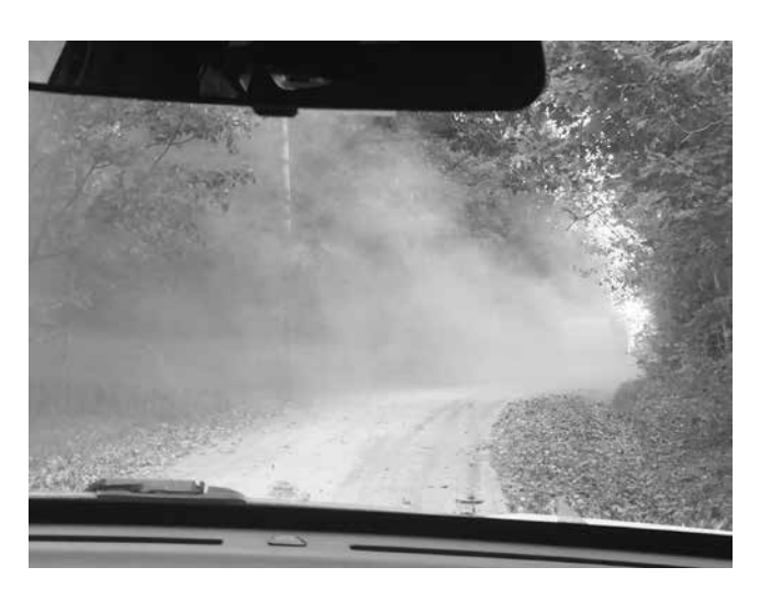
Motorists don't like to see dust from unpaved roads. Municipalities can control dust by installing good aggregate, applying dust suppressants, and performing routine maintenance.

This tech sheet will cover obtaining and properly installing quality aggregate, preparing the road with proper maintenance, and choosing and appropriately applying dust suppressants. Selecting and placing geosynthetics is covered in another tech sheet.